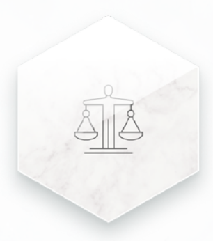
Public Procurement, Projects & Energy