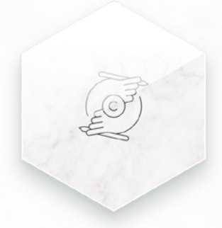
Intellectual Property and Competition Law