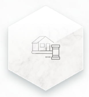
Real Estate and Environmental Law