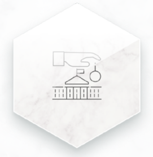
Corporate and Commercial Law